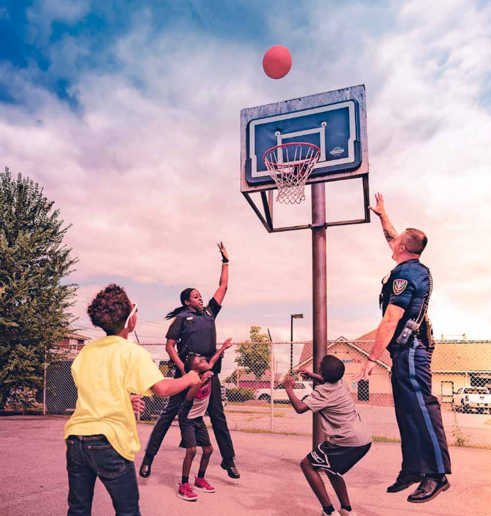
RPD officers take some time to engage with kids at the West End Center located adjacent to our West End Branch.

Why would a bank build a branch in a struggling community?